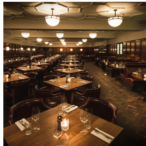
Guildhall EC2V 5BQ