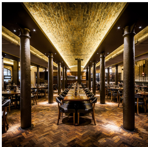
Seven Dials WC2H 9JG