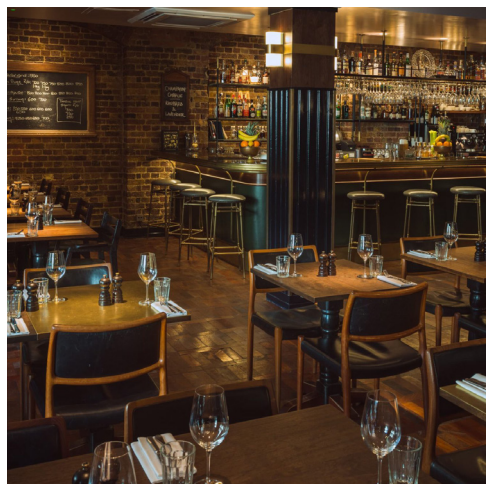
Spitalfields E1 6BJ

All our restaurants are available for full hire. To enquire, please email events@thehawksmoor.com