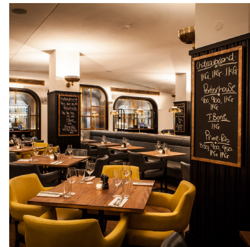
Knightsbridge SW3 2AL