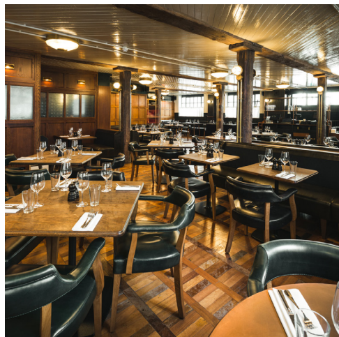
Borough SE1 9AQ