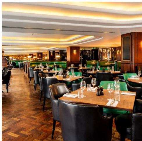
Air Street W1J 0AD