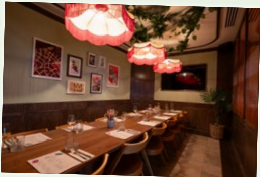
Private Dining Room 2