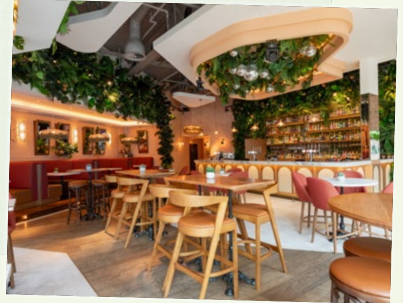
Bar & Casual Dining