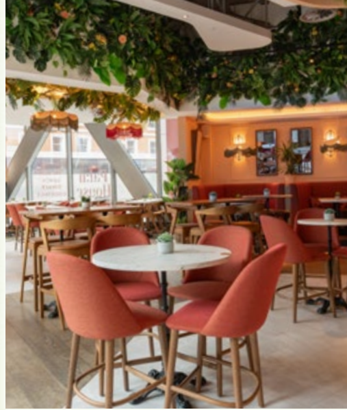
Casual Dining Space