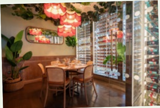
Private Dining Room 1