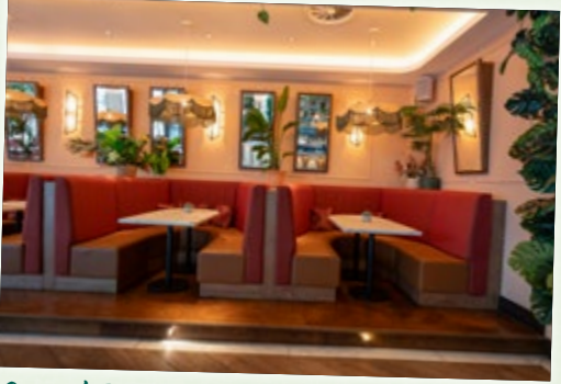
Casual Dining Space