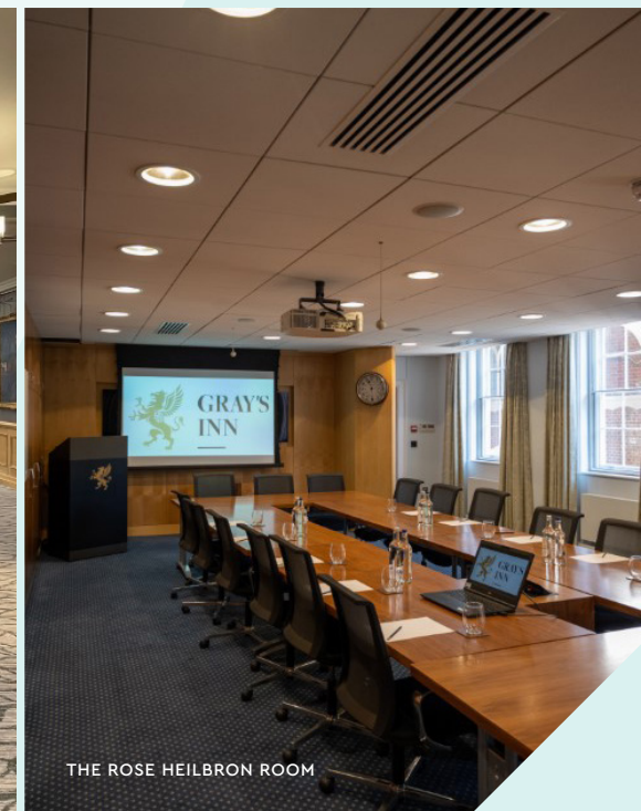
THE ROSE HEILBRON ROOM