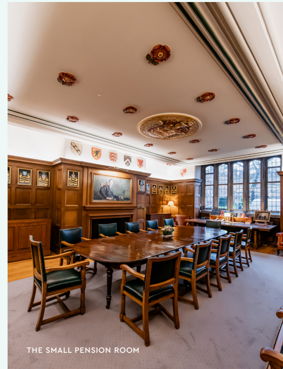
THE SMALL PENSION ROOM