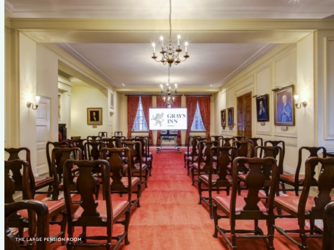
THE LARGE PENSION ROOM

MEETINGS AND CONFERENCE FOR 10 TO 20 GUESTS