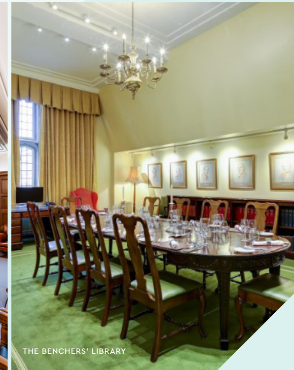
THE BENCHERS' LIBRARY