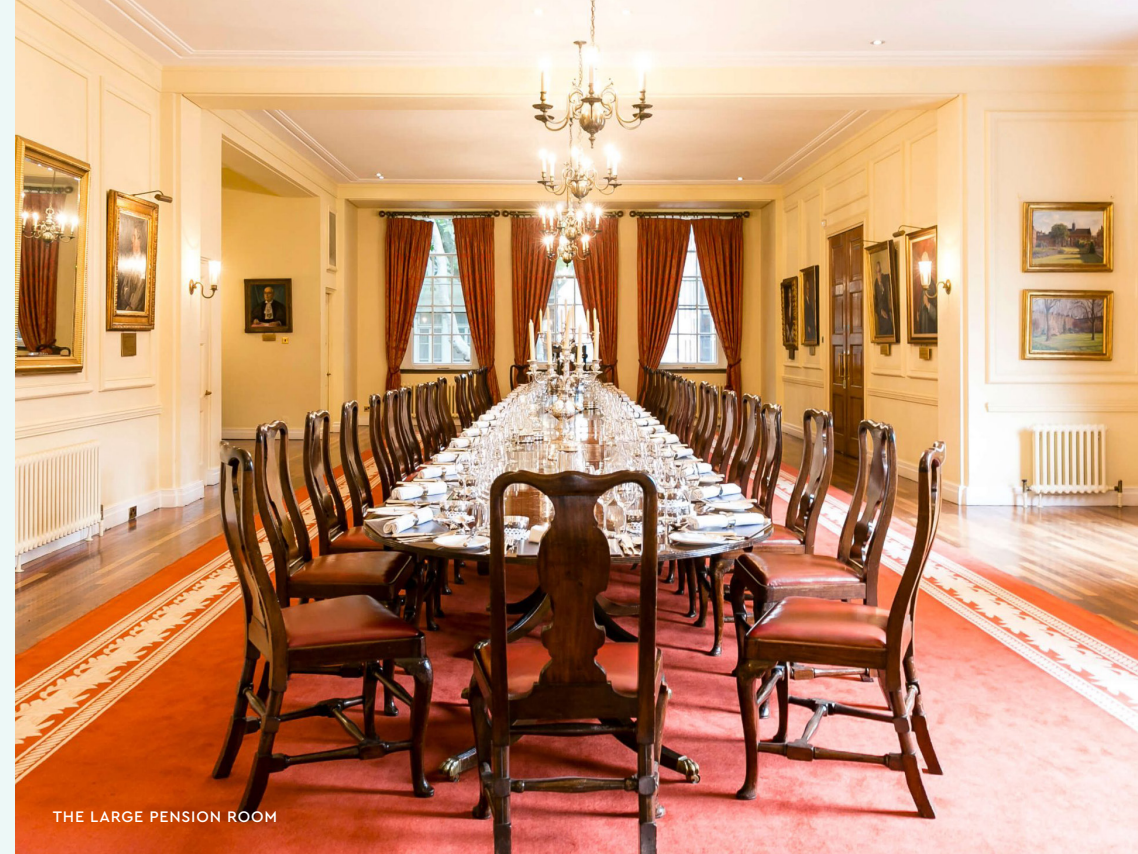
THE LARGE PENSION ROOM