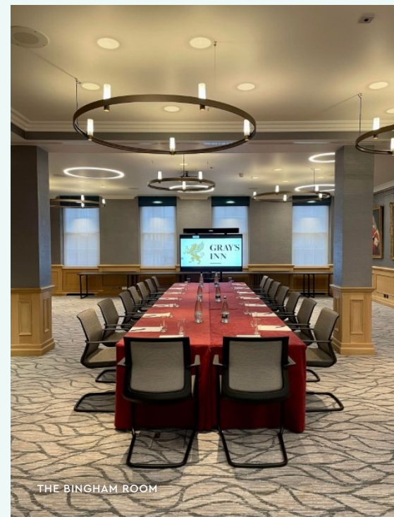
THE BINGHAM ROOM