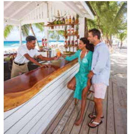
BARS & PREMIUM BRAND DRINKS