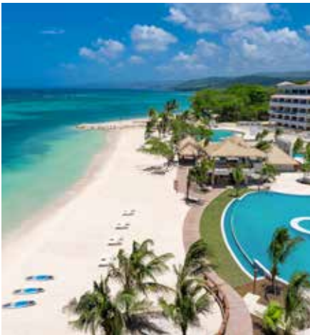
THE CARIBBEAN'S BEST BEACHES