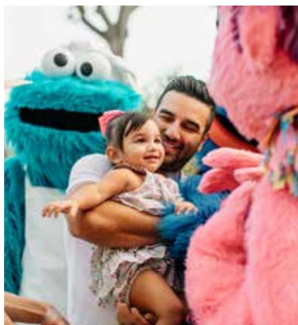
ENTERTAINMENT FOR ALL AGES