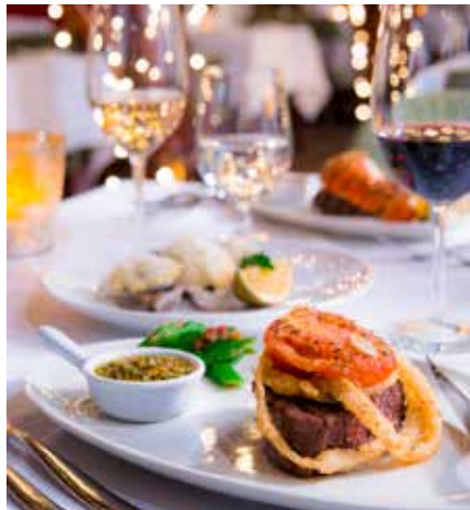
5-STAR GLOBAL GOURMET™ DINING