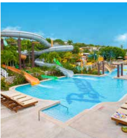
PIRATES ISLAND WATERPARKS