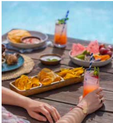
BARS & PREMIUM BRAND DRINKS