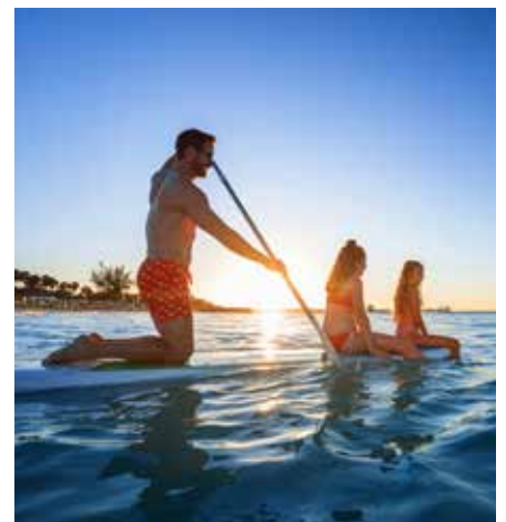
UNLIMITED LAND & WATER SPORTS