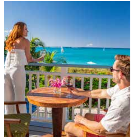
SPECTACULAR ROOMS & SUITES