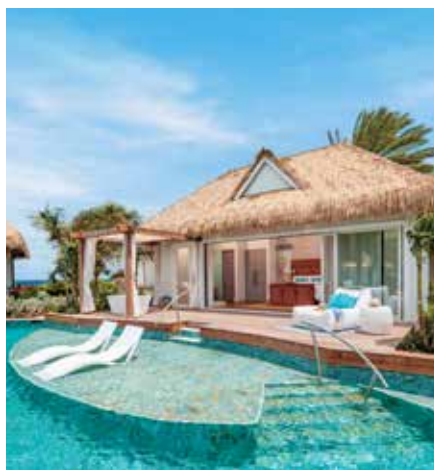
LUXURIOUS ROOMS & SUITES