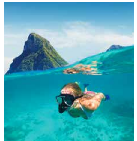
UNLIMITED LAND & WATER SPORTS