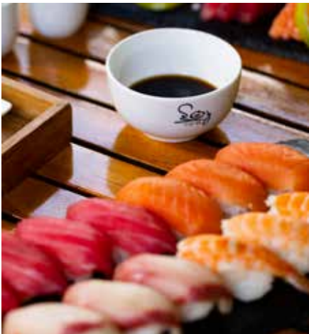
5-STAR GLOBAL GOURMET™ DINING