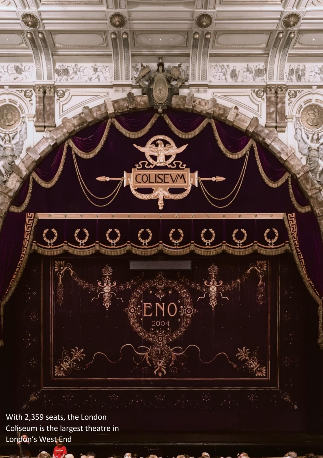
With 2,359 seats, the London Coliseum is the largest theatre in London's West End