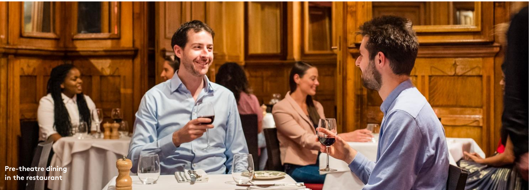
Pre-theatre dining in the restaurant