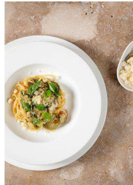
Regional Tasting Menu