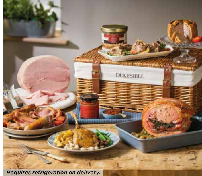
Requires refrigeration on delivery.