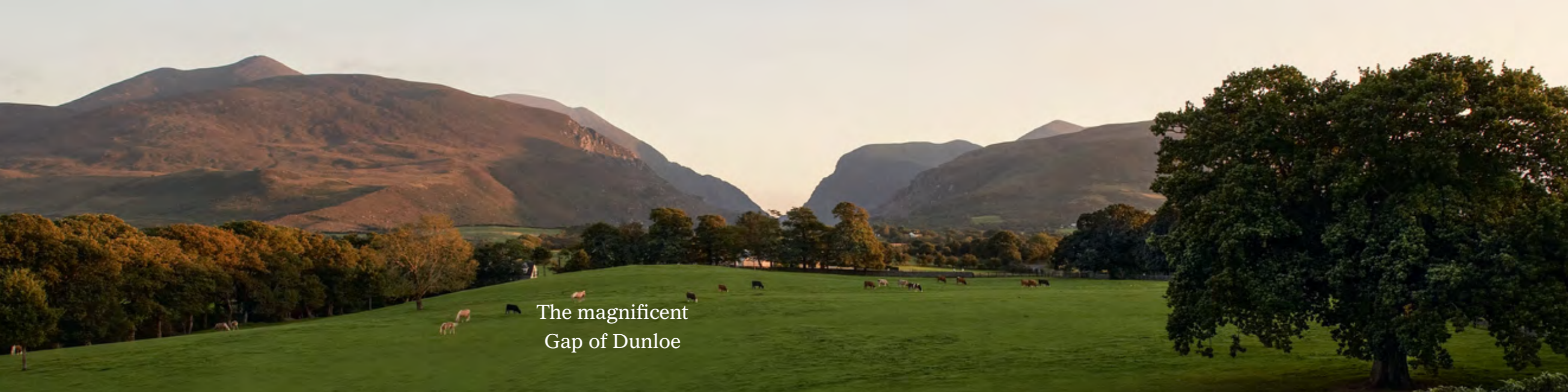
The magnificent Gap of Dunloe